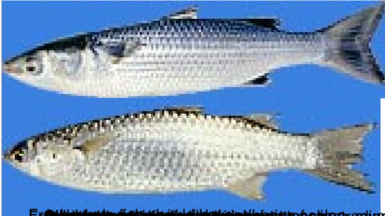
Figure 1. Mullet (Mullet) fish. The fish is shown in a lateral position. The fish is shown in a lateral position.